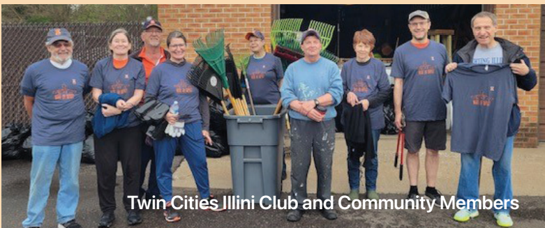
Twin Cities Illini Club and Community Members

Thank you to 3M, the Twin Cities Illini Club, and community members for your service! ■