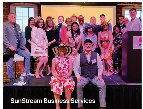
SunStream Business Services